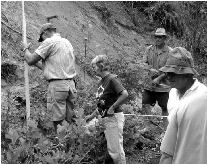
Docents creating “stable points” along Kings Creek.