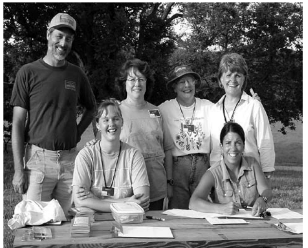
Wildflower Walk helpers