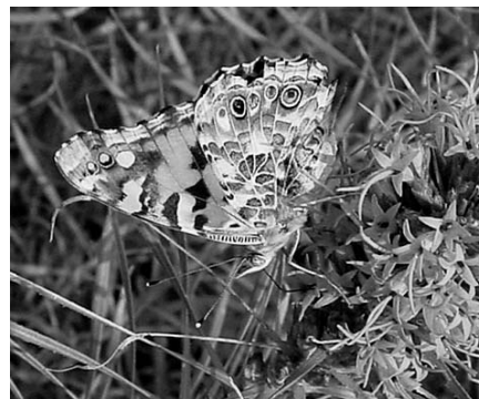
The Painted Lady is a migrant to Konza Prairie.