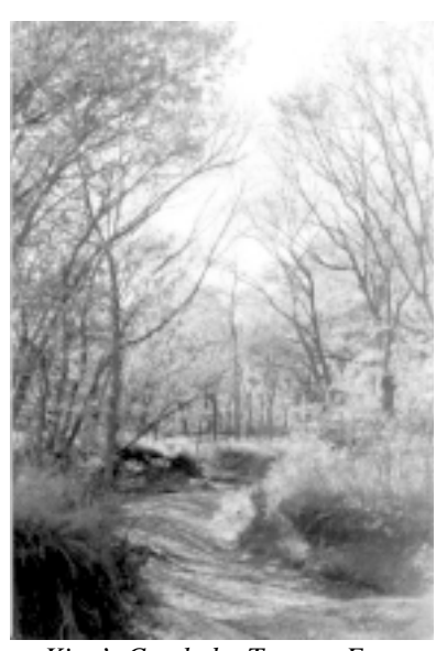
King's Creek. by Tawnya Ernst

was the focus of Magill's summer research. Magill sampled seven side-pool sites along King's Creek, south of the Nature Trail bridge. A side-pool is created when water levels in the main channel rise and fall, leaving pools or channels isolated from the rest of the creek.