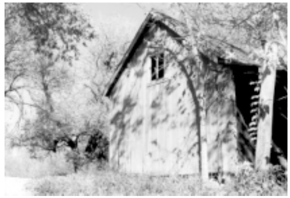
Shed to be refurbished.

"There's going to be a lot of physical labor